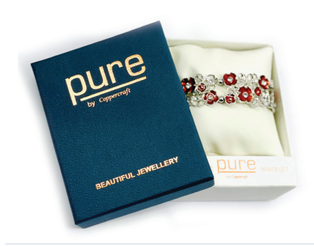
Magnetic Hematite Bracelet Boxed