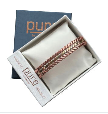
Magnetic Bracelet Boxed