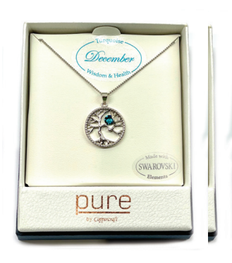
Swarovski Birthstone Pendant Boxed